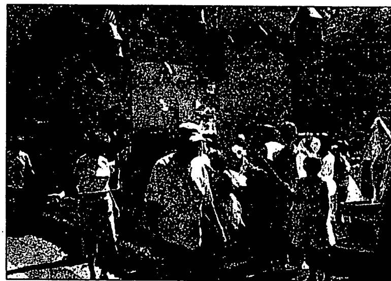
The Sleeping Beauty float, by firefighter Chuck Nudd and friends and family, took first place in the maxi-float division.